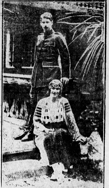
Here are Crown Prince Charles of Rumania and his wife, the former Princess Helen of Greece. The couple plan to leave Europe in the spring, and visit this continent from coast to coast