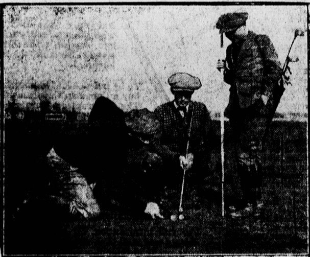
Even in home life, Nick Altrock, celebrated baseball comedian, cannot refrain from his monkeyshines. He is shown on the links in Washington, bound to make his shot if he has to use a change of form to do so