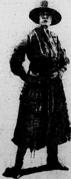
Viola Dana, well-known screen comedienne, dressed herself to represent Rudolph Valentino, and danced the Argentine tango with her sister, Shirley Mason, at an actors' fund benefit staged in Los Angeles