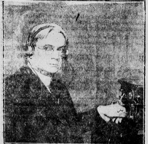
Senator Hiram Johnson is pictured at his New York campaign headquarters as he listened over the radio to President Coolidge's first message to Congress, which was broadcast all over the country