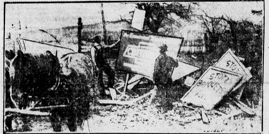
The "Main Street" state is now leading the world in the fight on eyesores. Following the new Minnesota law prohibiting advertising signs, on state trunk highways, workmen are shown tearing down small tin tags to huge billboards