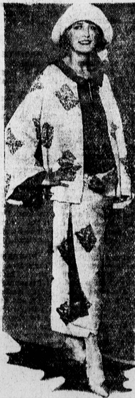
This imported Palm Beach suit was one of the many extremely smart garments displayed at the Dance and Fashion Promenade held in New York recently