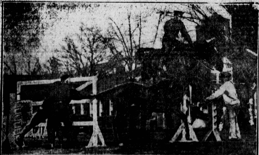
A trooper of the U.S. cavalry goes "over the top" at Fort Myer, Virginia, at an exhibition of roughriding, given for the benefit of the Army Relief Society. How would you like to be one of the two lads at the right?