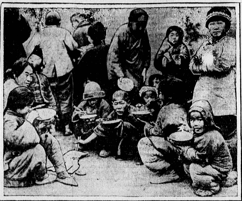
CHINESE RED CROSS PROVIDES REFUGEES FIRST SAFE MEAL. Some of the 5,000 refugees from a safe zone. The refugees reached here after travelling from Chinchow via Shanhaikuan and a devious route. Many left all their earthly possessions behind, fleeing on improvised wooden sledges propelled over the ice by two iron bars in the hands of a human "propeller."

P. W. C. Alumni Society Formed Graduates Indorse Suggestion Of Fund For Special Equipment Of New College And Organize Alumni Association.