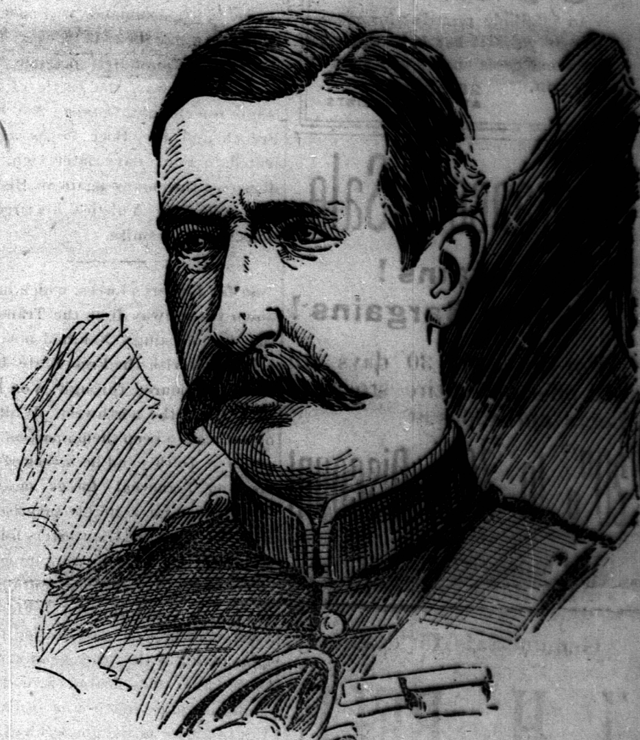
GEN. SIR REDVER BULLER.