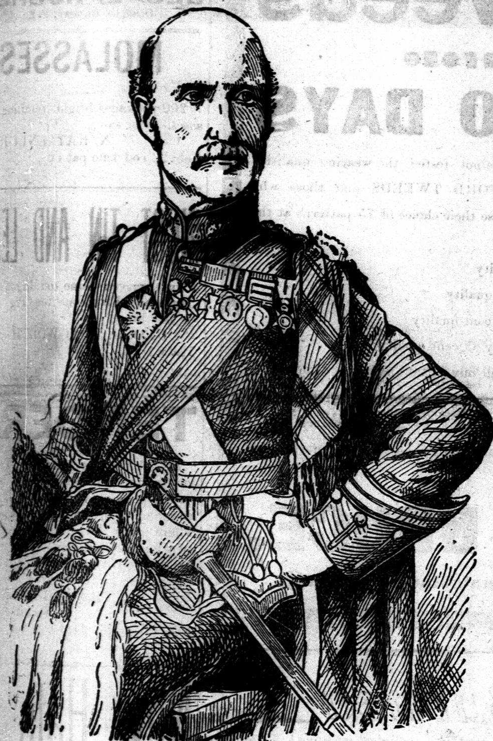
GEN. SIR GEORGE S. WHITE.

STORKSPRUIT March 1. (Special) The Boers admit fifty killed, 125 wounded and 300 missing when Brabant recaptured Jamestown.