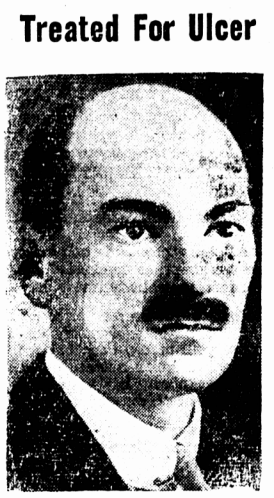
Treated For Ulcer

Efforts To Settle Berlin Crisis Fail BERLIN, Sept. 9 (Thursday)—(CP)—The Russians rejected early today a French protest of the "double cross kidnapping of 13 Western Berlin policemen." The French protest, made by Maj.-Gen. Roger Noiret, deputy French commander in Berlin, demanded the release of the 13 Germans. They were snatched at dawn yesterday by Russian machine-guns and eastern sector Berlin police while travelling under a Soviet safe conduct guarantee from the besieged city hall. The Russian deputy commander, Lt.-Gen. M.I. Dravlin, replied to Noiret in a letter published tonight by the Soviet News Bureau. The French protest coincided with a United States protest to the Russians against Communist disorders at the city hall clamored by the mass kidnapping. The American commandant, Col. Frank Howley, sent the protest to his opposite number, Maj.-Gen. Alexander Kotikov. Howley condemned the recent