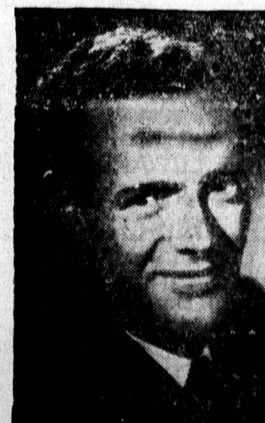
RUSS TITUS, Canada's top Radio male singing personality.

TICKETS ARE NOW ONLY AVAILABLE AT MILLER BROS. AND THE FORUM, CHARLOTTETOWN. SEATS STILL AVAILABLE IN ALL SECTIONS (Including Sides). BETTER GET YOURS NOW AND BE SURE OF A SEAT.