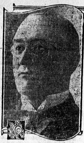
Hon. G. H. Murray, premier of Nova Scotia from 1896 to 1923, died in Montreal recently, after a three days' illness from pneumonia.