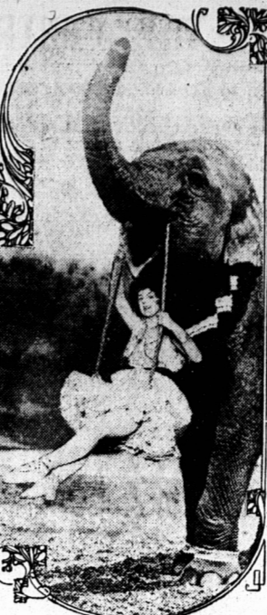
ELEPHANT SWINGS PRETTY GIRL

JOHNSON & JOHNSON The Quality Druggists Corner Kent and Prince Streets