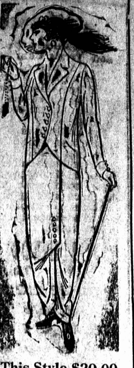
This Style $20.00