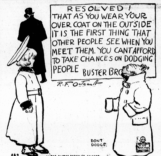
LOOK AT YOUR WINTER'S OVERCOAT AND SEE IF THE CLOTH ABOUT THE SEAMS IN THE BACK AND AROUND THE CUFFS IS NOT BADLY WORN.

Chase & Sanborn's delicious Coffee is always the same and always the best. If you are a coffee lover, Chase & Sanborn's will win your heart.