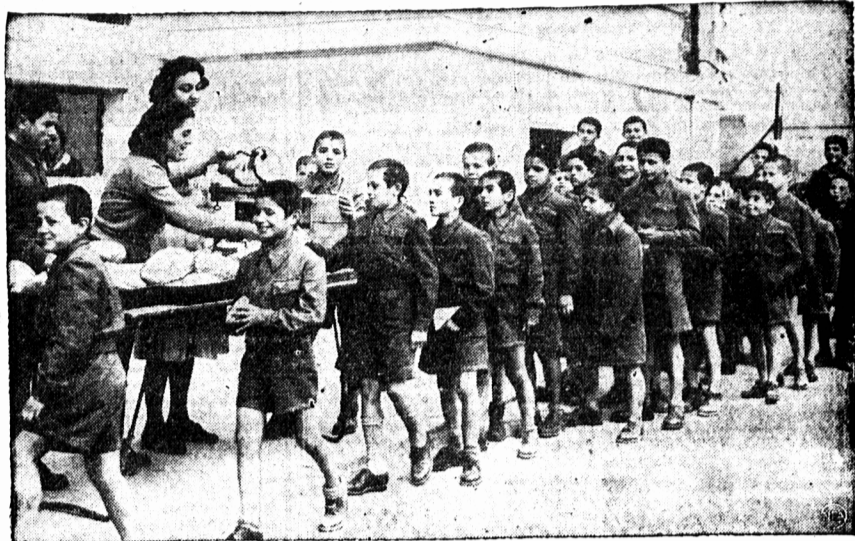
AMERICAN BREADLINE — IN ATHENS — Small boys from the Athens, Greece, "Children's City" line up for a slice of bread, part of some 2220 loaves made from the millionth ton of Marshall Plan aid to arrive in Greece. The flour, from Higginsville, Mo., was made into bread by Greek army and distributed to relief agencies sponsored by Queen Fredericks.