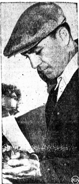
COMEBACKER — Ben Hogan, playing his first gold tournament since his almost-fatal accident 11 months ago, checks his scorecard after 72 holes of the Los Angeles Open at Santa Monica, Calif. At the end of the regulation 72, Hogan and Sammy Snead were tied for first with 230.