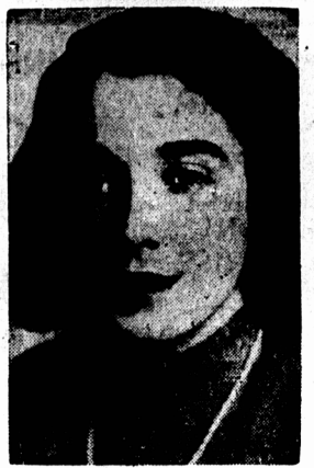
BEATEN BY BOY