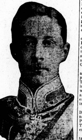
GERMAN CROWN PRINCE.

"We speak openly of victory," the Crown Prince said. "The word victory must not be understood to mean