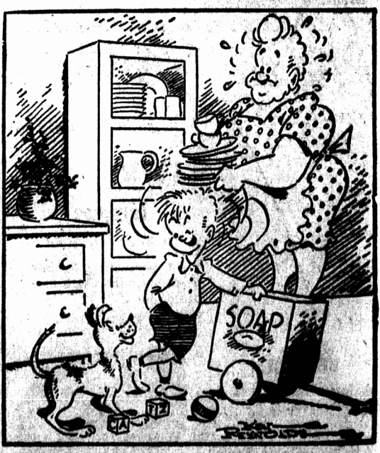
"Mom, tell me again about how you got me with a Guardian Want Ad!"

Leading in Quality! RED ROSE TEA "is good tea" RED ROSE Orange Pekoe Tea is extra good!