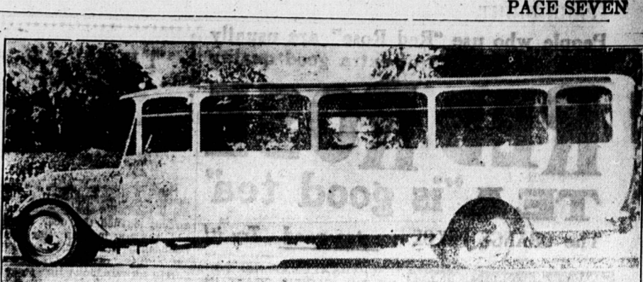
TORONTO'S NEW SIGHT-SEEING CAR. Observation coach of the type the Toronto Transportation Commission will put into service about June 1. One of these coaches will run on a touring schedule of one hour. The other will proceed on a two-hour schedule. The charges will be 75 cents and $1.50, respectively, for the trips, which will embrace all principal points of interest in Toronto. In the evening the coaches will be put into service from the downtown district to Sunnyside Amusement Park.