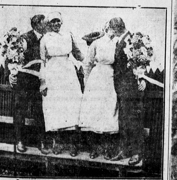
HOW'D YOU LIKE TO BE A TUTTI MAN? A kiss from the ladies, a punny from the men are the dues collected by the Tutti men who, following an ancient Berkshire custom, go around with flower-bedecked staves. The photograph shows the Tutti men buying tribute from the hospital nurses at Hungerford.