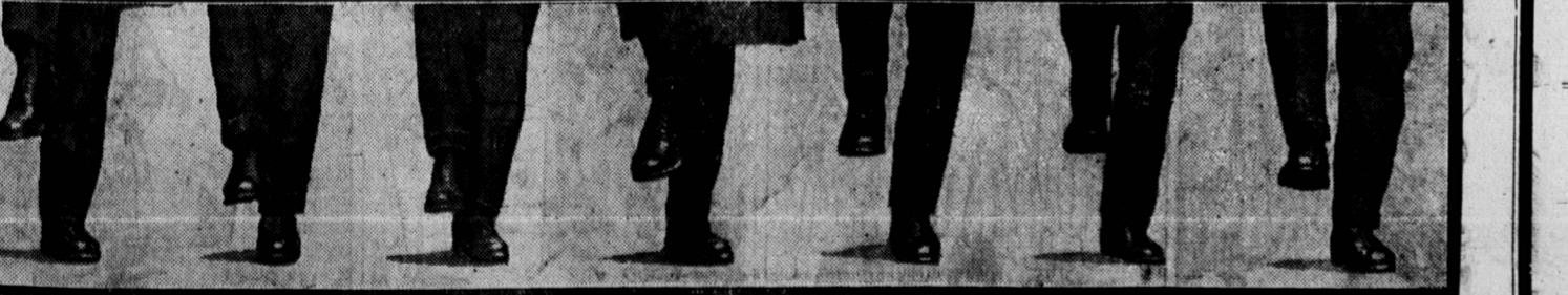
It is a debatable question whether or not beer tastes better if the consumer has a brass rail to rest his foot. There may be something in the theory that the slight elevation of the foot increases one's capacity for holding beer. The above photograph taken through the street window of a Toronto hotel, shows the feet of some "old timers" unconsciously going through a peculiar "stamping" movement as they sit down to sample a glass of Ontario's famous 44 Nickle beer. The beer was all right but they missed the old rail on which to rest their broken arches and tired feet.