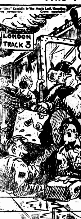
"Hasn't changed a bit in two years!"

GIANT CABLE SHIP WALLSEND-ON-TYNE, England (CP) - A cable ship, H.M. Telegraph Ship, Monarch, believed to be the largest in the world, has