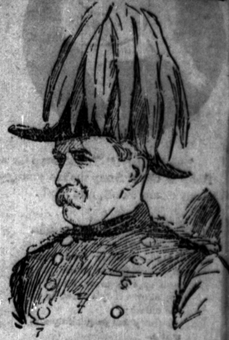
MAJOR-GENERAL FRENCH (Cavalry). In command at Blandsharpe.

"Success to ours." [Signed.] SEARS. The Mayor also sent greetings to the men through Lord Strathcona.