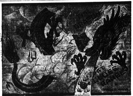
Monsignor McGrath's up to the minute book on the China that lies beyond Shanghai.

With 110 human interest illustrations in sepia on best art paper.