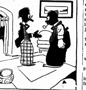
PLAY THAT'S WORK "Do you play cards for money?" "Yes, but I've found it hard work to get it."