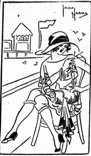
When mosquitoes are thick at a race track no time is wasted scratching horses.