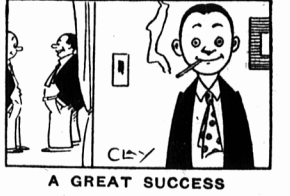
A GREAT SUCCESS "You think your son's attendance at college was a great success?" "Yes; he didn't commit suicide or break any of his bones."