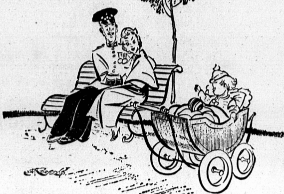
"If you two would like to go off by yourselves it's O. K. by me—and I'll scream the place down if I see mother coming."—Humorist.