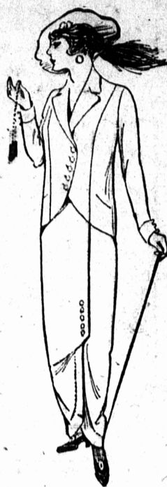
Sketch of a Prowse Suit

Specializing in Suits for Misses and Little Women