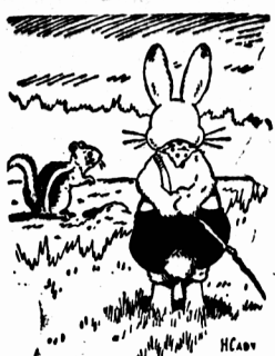
"Digging is fun," declared Little Stripes

"Don't ask me. I've never dug one. It is easier. Use one some one else has dug if I ever really need one, which isn't often," replied Peter. "When I need to go under ground there usually is one handy," he added. "I don't want a house some one else has dug. I wouldn't ever feel that it was my very own, and