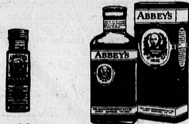
Original Coarse Granule Abbey's Still on sale.

The new Abbey's is sold by all druggists in a smart new package of blue, grey and white.