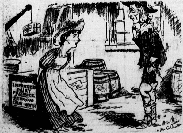
"Is this from your milking, my pretty maid? No—brought from abroad, kind sir," she said. The British Minister of Agriculture is investigating the dairy industry. In one month the United Kingdom imported $6,000,000 of butter. From the News of the World.