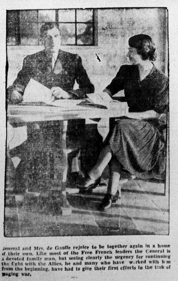
General and Mrs. de Gaulle rejoice to be together again in a home of their own. Like most of the Free French leaders the General is a devoted family man, but seeing clearly the urgency for continuing the fight with the Allies, he and many who have worked with him from the beginning, have had to give their first efforts to the task of waging war.