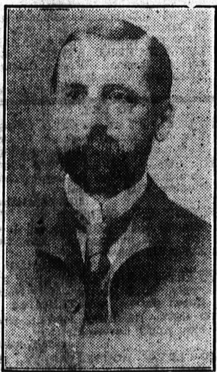
HON. GEORGE PERLEY Deputy Minister of Militia and Defence for Overseas.