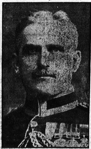
SIR SAM HUGHES Ex-Minister of Militia and Defence