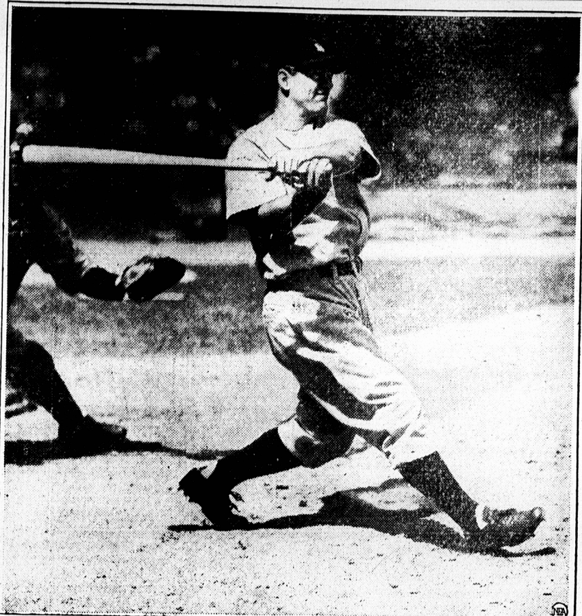
Lou, Gehrig, Captain of the world champion New York Yankees, who led the major leagues in home runs with 49 and was a potent factor in the triumph of his team over the Giants. Gehrig is known as the iron man of baseball having participated in over 1800 consecutive games. He holds down first base on the Ruppert outfit.