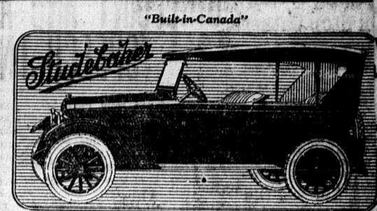
1923 SERIES STUDEBAKER LIGHT-SIX TOURING CAR, $1375