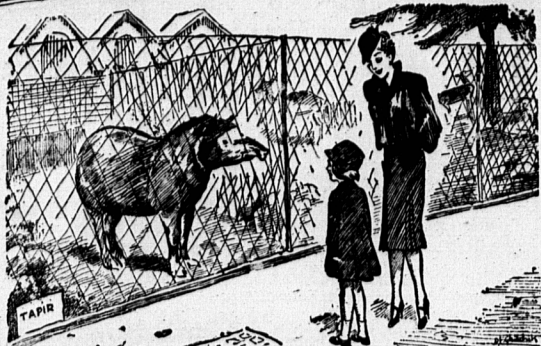
"Mumme, why doesn't some tell that poor animal it doesn't need its gas mask any more?" —Humorist.