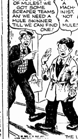
THE LOST AR