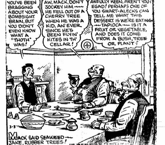
With Major Hoople