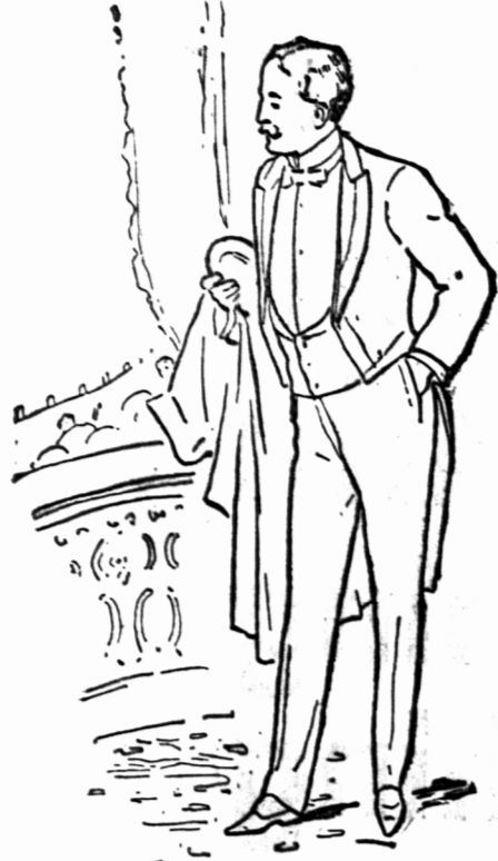
Full Dress Suit.

Made of fine black English Venetian cloth, warranted not to rust, nor shine from wear.