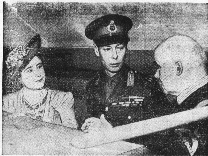
King George and Queen Elizabeth conscious of their tremendous responsibility, exercise unceasing vigilance on their people's behalf. Heedless of personal danger, they visit bomber areas and examine provisions against further casualties. Here they are seen chatting with an A.R.P. controller in an east end London air raid shelter which they visited on a recent tour.