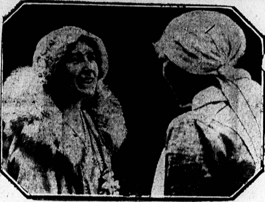
POPULAR DUCHESS AT HARROW HOSPITAL