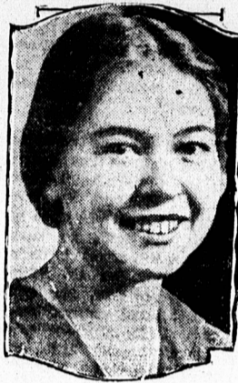
WINS MODELLING PRIZE