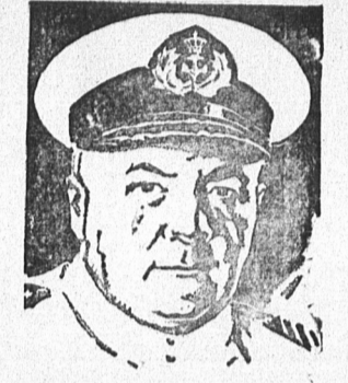
DUTCH Vice Admiral Conrad, Emil Lambert Helfrich, 55, commands united naval forces at Java, believes "the best defense is offense."

Magellan discovered the Philippine Islands in 1521. He also discovered Guam. Would you like to read your past and future in your hands. It's easy. Run the fingers of your right hand lightly over the back of your left hand. Does the skin feel rough and chapped? That means you've been exposing your hands to wind or cold-dipping them in hard or cold water-using harsh cleansers or soap-or perhaps simply living in a steam-heated apartment. All these things-wind, cold, hard and cold water, harsh cleansers and soaps, steam heat-rob your hands of natural, softening moisture. But don't worry - right now the future looks particularly bright. For you can replace this natural, softening moisture by applying a smooth, quick-vanishing hand cream made specifically for the purpose. Keep your hands smooth, white, young-looking by applying hand cream after washing or exposure. A few minutes' care every day will make the busiest hands look pampered!