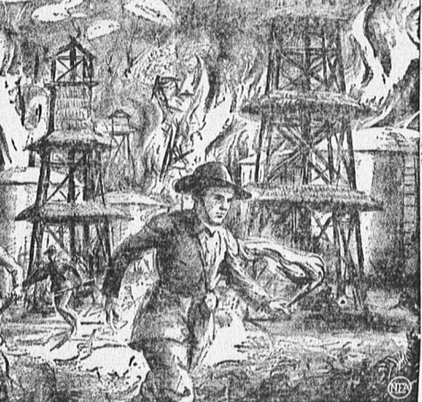
DUTCH PUT THE TORCH to the oil of the Indies when Japs invaded. Great blazes and blast long prepared for with installations of explosives, swept through the forests of derricks, pumps, storage tanks and refineries even as the enemy parachuted out of the sky or landed on nearby beaches. First to go was the oil of Sarawak, destroyed by the British; then followed Tarakan, Balikpapan and Palembang, as the Dutch scorched earth with the hottest of fires.