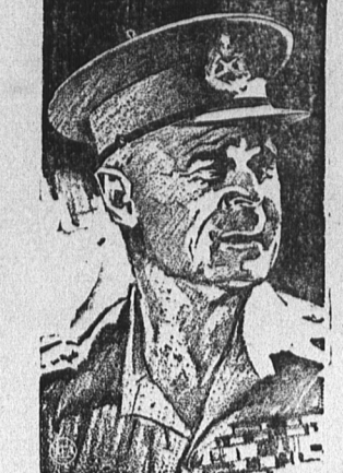
BRITISH Gen. Sir Archibald Percival Wavell, 58, commander of United Nations forces in Far East, looks with apprehension toward Java.