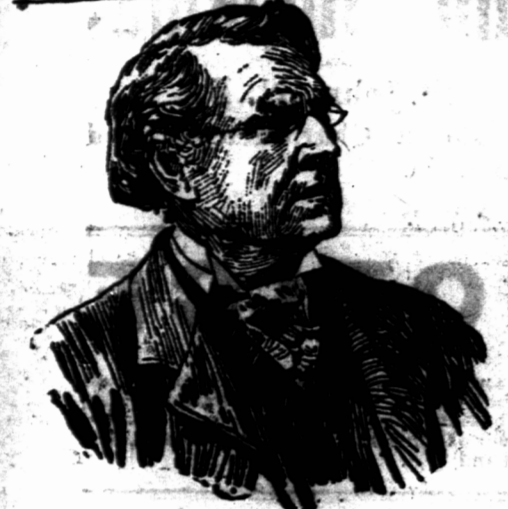
HON. EDWARD BLAKE.