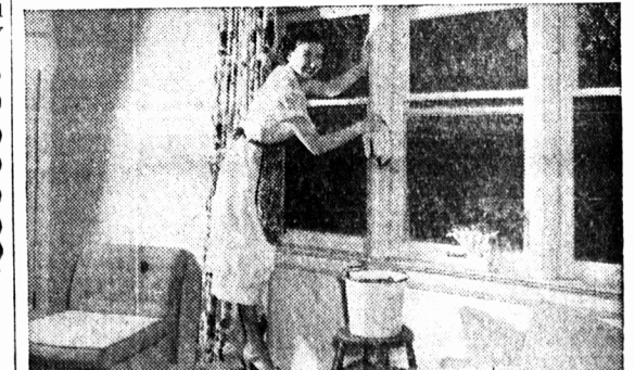
For floors, windows, walls, woodwork—Quix is a must in the kitchen, the laundry—wherever there's a cleaning task to be done.