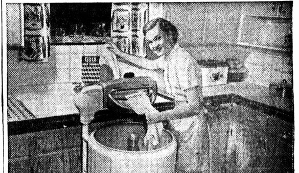
You'll see with your own eyes what a really nice job Quix will do in your machine. And when you're finished—there's no heavy "jelling" of undissolved soap scum clinging round the inside of the washer. A quick swish round with the hose, and a wipe—and it's clean and ready to be put away till the next washday.

The new type Quix assures women that they can trust all their house-cleaning jobs to Quix. It works equally well in washing machine, laundry tub or dishpan. Many women are finding the Quix half-hour "soak" method a real work saver in extreme cases of heavily soiled white linens and cottons. They just drop them into a really hot bath of Quix suds and leave them to soak for a brief half-hour. Then, with hardly a rub, they rinse them out in luke-warm water. Lightly soiled, colour fast things will usually soak clean in about ten minutes.