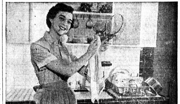
Quix makes dishes and glassware gleam with sheer cleanliness. And your hands won't have that dried up "chapped" feeling afterwards. As for the thick grease and baked-on crust that clings so stubbornly to pans and casseroles—set them to soak in the lively Quix suds as soon as they're empty. By the time you start to wash-up, they'll be soaked so loose you can free them easily and quickly.