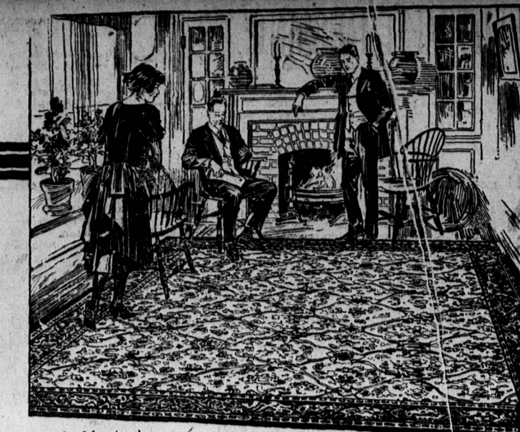
In the 9 x 9 foot size, the rug shown costs only $13.50

J. B. ROMBOUGH, J. A. MacDONALD, Auctioneer. 1270-10-24-4f.