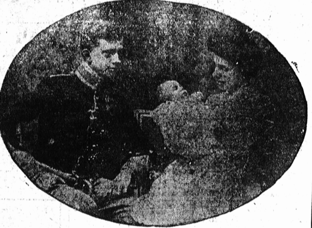
Almost on the same day when an heir was born to the Spanish throne the son of Alfonso's sister, Princess Ferdinand Maria, of Bavaria was christened at Munich. The princess was married in January 1906 is here shown with her husband holding in her arms her son and heir. She strongly resembles King Alfonso.

(Continued From page 1.) At this time he pints his thumb at his chest and says, "Popah! Th' foreman bein' th' father iv nine himself, shakes him be th' hand. An' that's all there is about it. We don't hear th' details. In Archey Bood it ain't considered polite to discuss thim. "But with riley 'tis different, 'dye mind why, I know asmuchaboutthisherehappy evint in Spain as though I had a room in th' house. Weeks ago th' papers begun discussin' it, an' 'ver since there's been no let up. I feel kind iv sorry for Alfonso. If it's hard to be winked at an' nudged by ye're particklar frinds, it must be th' divvie to have th' whole wuruld winkin' at yo an' nudgin' ye. Up to a few months ago I hadn't heard anything much about him frim th' day he was married, when wan iv his rife subjicks b come soenthusyastic over th' nuptials; that he thrid to d'rop eight pounds iv home-made althro glycerine in his liege's lap. "There were about tin thousand babies born in Spain th' same day th' Prince iv th' Asturias come into th' wuruld. It don't make so much difference how he threats thim. He can't do much fr thim except let thim see him want a week d'ressed in his best suit iv clothes. It's what they'll do to him, I'm wondrin' about."