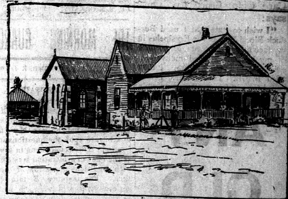
CHURCH AND PARSONAGE TYPICAL OF THE TRANSVAAL

Till Help Reaches Him—His Artillery Superior to the Boers—Buller Goes to Durban—Canadian Government Offers Another Thousand—Believed They Will be Accepted—Fate of Colenso Uncertain.