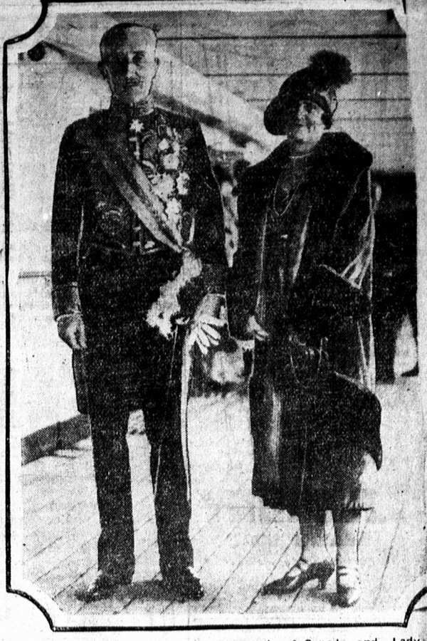
Viscount Willingdon, 13th governor-general of Canada, and Lady Willingdon, photographed on the deck of the Empress of Scotland prior to debarkation at King's Wharf, Quebec City.