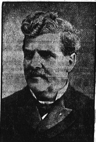
HON. H. R. EMMERSON

CHICAGO, December 15.—(Special.)—Dec. Corn 45 1/2 May Corn 45 1/2 Wheat 107 1/2 Wheat 111 1/2 Pork $12.55 Pork $12.00