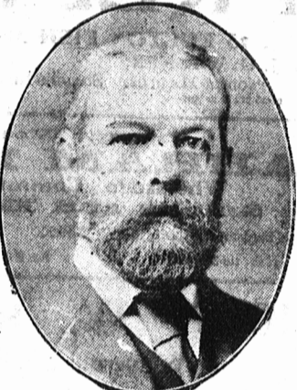
HON. SYDNEY FISHER, Minister of Agriculture.

At the official opening in the evening a large audience assembled in the lecture room E. B. Elderkin presiding.