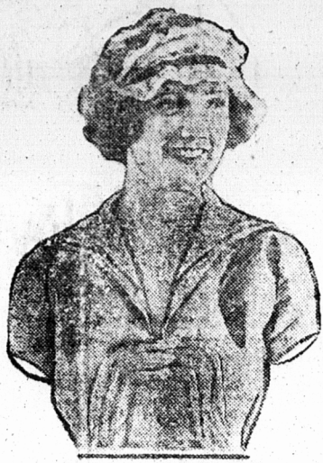
THE VENUS DE SMILE

Some Doll was the Venus de Milo. Yea, a Wiz in feminine guilo; But for Vampin! Say, Bo, Play it win, place and show On the wiles of the Venus de Smilo.