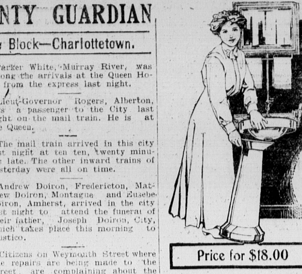
Price for $18.00

London, Aug. 1.—Scotland Yard officials had not exact information as to whether Crippen will be deported or extradited but they anticipate deportation, in which case Crippen will be placed on trial within three weeks.