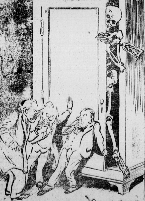
THE SKELETON IN THE CUPBOARD

Conservative, Liberal and Labor Parties (together): "Oh! no, we never mention it." (Reduced taxation, the one thing likely to secure unanimous support in Britain, has been raised by none of the parties.) —From London Opinion.