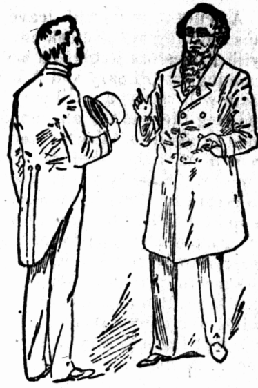
Dr. A. W. Chase Tells a Friend That Eighty Out of Every Hundred of Humanity are Affected by Kidney and Liver Troubles.

Dr. Chase in his wisdom foresaw the need there would be for so grand a medicine as Dr. Chase's Kidney-Liver Pills, and so universally have they become known and used that go where you will round the globe, you'll be able to buy them.