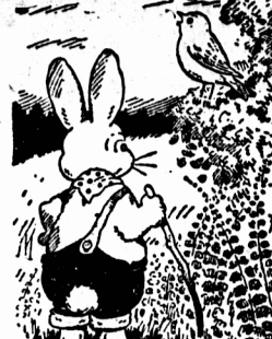
Peter Rabbit calls Little Friend the "Sunshine Bird"

"I've been thinking," began his little mate.