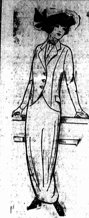
This Style $15.00