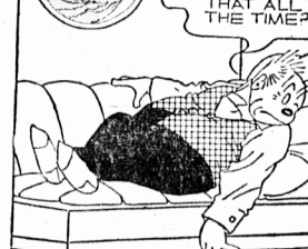
IM NOT BLOWING THE FOG-HORN—THERE ISN'T ANY FOG AND REEBES—THERES NO FOG-HORN ON THE YACHT!

By George McManus WHO KIN SLEEP AROUND HERE WITH THAT FOG-HORN GON' LIKE THE TIME?