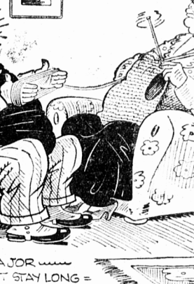
CHEER UP, MAJOR — MAYBE HE WON'T STAY LONG —

By George McManus CONFOUND IT, MARTHA, WITH THAT DIABOLICAL YOUNG LEADER IN THE HOUSE, I'D FIND LIFE MORE SERENE IN AN ENGLISH CHANNEL PORT! — SPLIT IT! I DON'T LIKE TO CAST ASPERSIONS ON YOUR SIDE OF THE FAMILY, BUT —