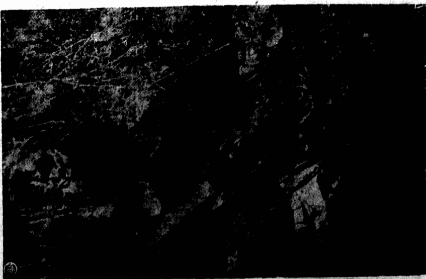
With its fuselage ripped open as if by a giant forest where it crashed Sept. 19. Twenty-six persons died in the wreckage, 18 survived. In a burned-out swath of desolate Newfoundland.