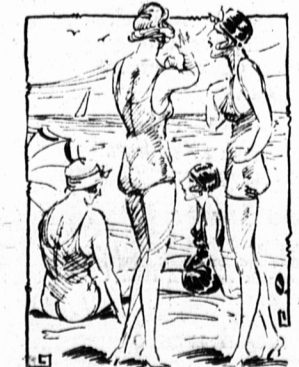
WHAT A PITY! A summer hotel by the shore. Went broke as hotels have before. But if the peaches could show All they wanted, Ho! Ho! They could have packed all their rooms and some more.