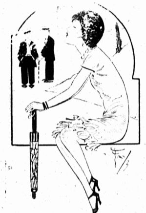
SHOULD KEEP TO THE LOWER LIMBS "Do you approve of the girls taking to the higher branches?" "No—they make a good enough showing in the lower limbs."