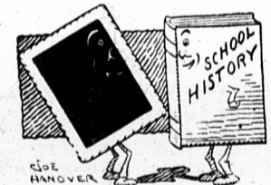
JUST ABOUT Slate (to history): It's about time we got busy!