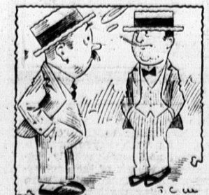
WHAT HE HAD LEARNED Friend: What has your son learned so far at the agricultural college? Dad: How to sow wild oats.