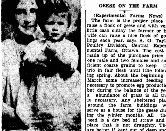
Millions of people from all parts of the world awaited anxiously the birth of Princess Elizabeth's son. Scotland Yard ordered extra police to Buckingham Palace to handle the crowds anticipated. Above Princess Elizabeth, when a small girl is seen with her mother, Queen Elizabeth.

TO BOTH THIS MEANT THE END OF REAL TRAIL. It was Lisbeth who spoke at last with wonder in her own voice: "Darling do you realize that was here we met, on this very corner, on just such a day as this?"