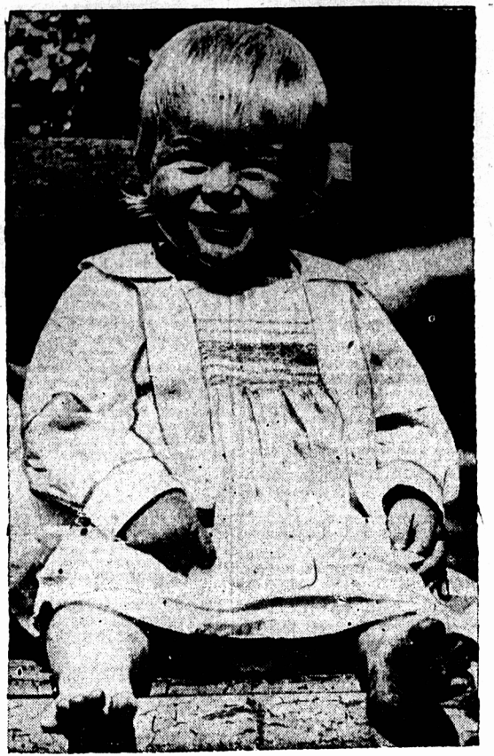
A son, who one day may rule the Commonwealth, has been born to Princess Elizabeth. The royal baby, who has been described as "bunny lad," weighed seven pounds, six ounces at birth.